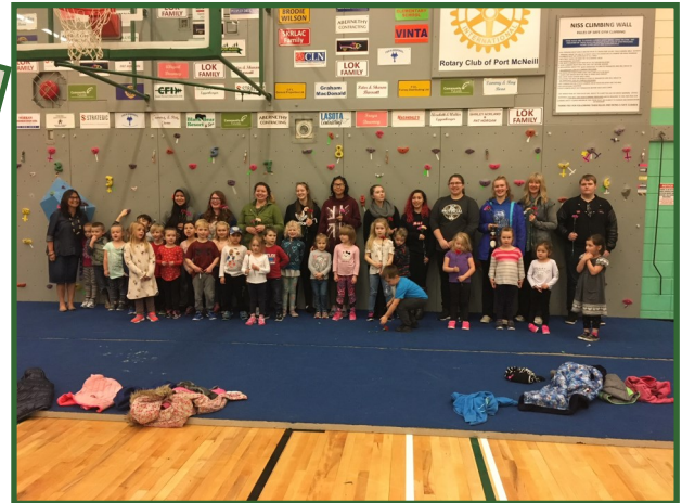
NISS staff and students were delighted to host Cheslakees kindergarten class at the Climbing Wall.