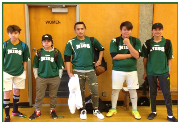
NISS Indoor Soccer Team