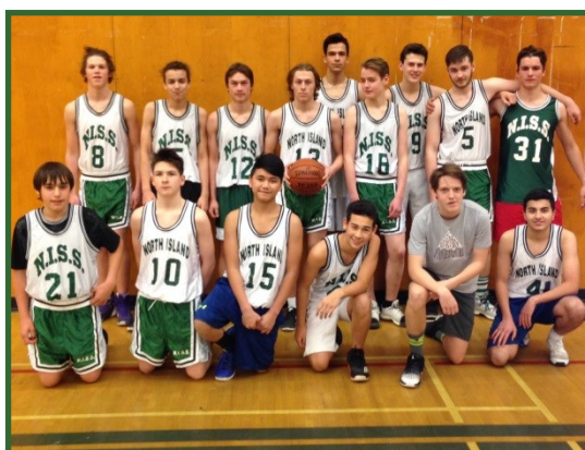
NISS Senior Boys Basketball Team

The gym is open during lunch on Monday, Tuesday, Wednesday, and Thursday, from 12:30-1:10 p.m. for intramurals, or free play. Come somewhere fun to eat your lunch, and participate, or watch fun activities. Right now we are playing floor hockey on Monday and Wednesday, and Basketball on Tuesday and Thursday.