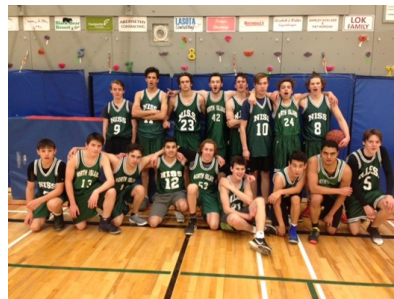
The senior Boys Basketball Team did well this year, but we were stopped at the North Islands in Gold River.

With the bad weather still with us, students often get wet feet during P.E., so can you please remind gym students to bring extra socks to change into. We do go outside, and hikes will occur unless it is raining hard. We all love living in the North Island but it is wet, so please remind students to dress appropriately.