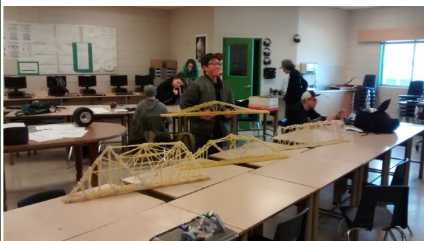
Grade nine Design and Skills class. Structures project. Spaghetti Bridges. Bridge must free stand, span a meter, consist solely of spaghetti and glue, weighing less than 1 Kg.